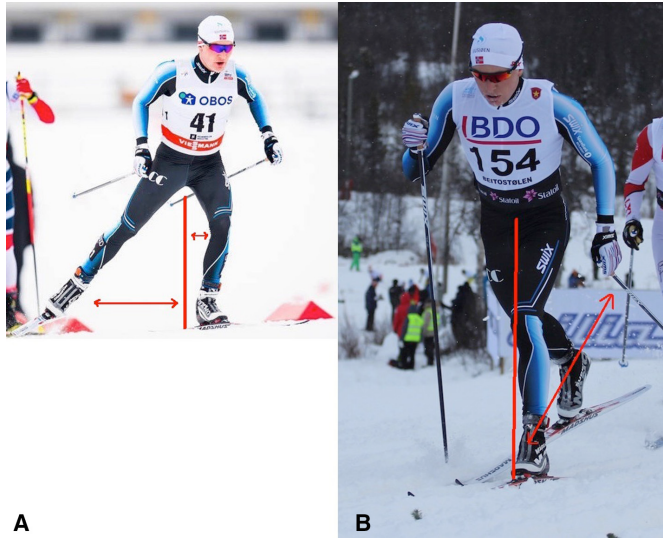
Figure 1 (a) Skating technique involving abduction/ adduction and internal/external rotation movements of the hip. (b) Classic technique with a primarily flexion/extension hip movement pattern.

study was to compare the presence of CAM-type FAI in a cohort of elite junior CC (EJCC) skiers with a control group of non-athletes (NA).